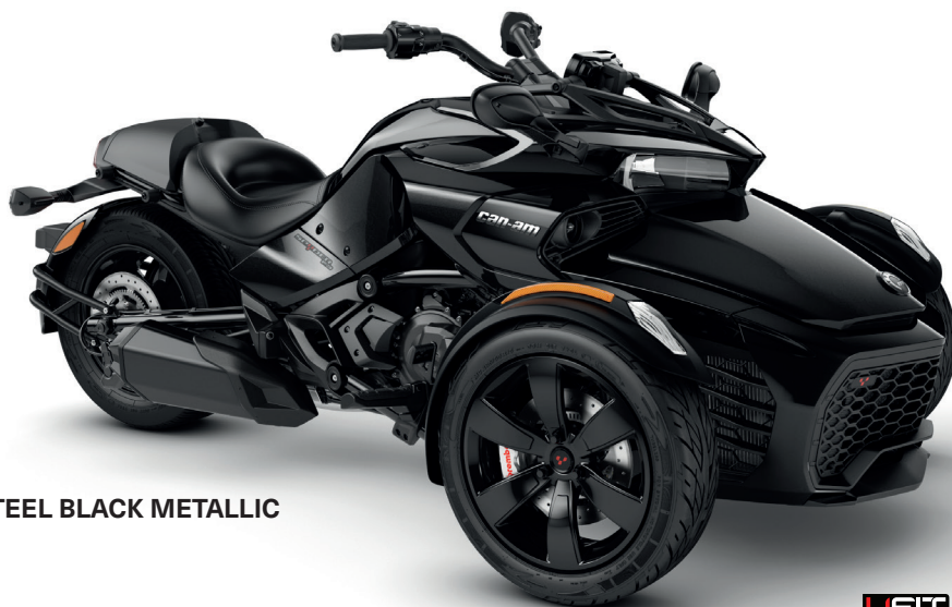
STEEL BLACK METALLIC