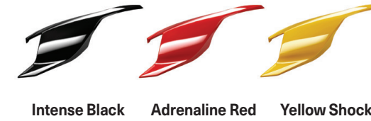
Intense Black Adrenaline Red Yellow Shock