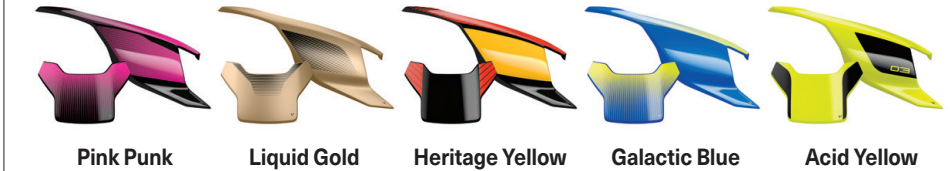
Pink Punk Liquid Gold Heritage Yellow Galactic Blue Acid Yellow