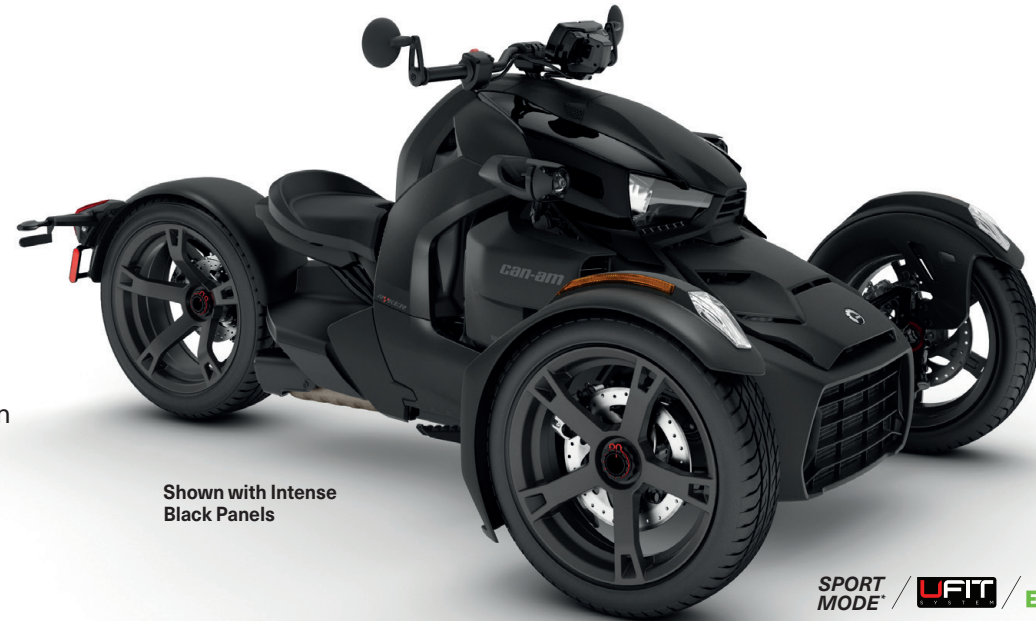
Shown with Intense Black Panels