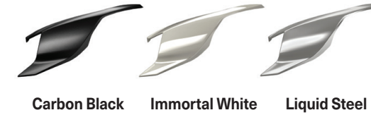
Carbon Black Immortal White Liquid Steel