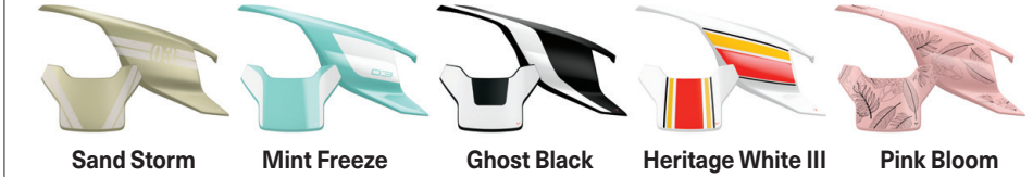
Sand Storm Mint Freeze Ghost Black Heritage White III Pink Bloom